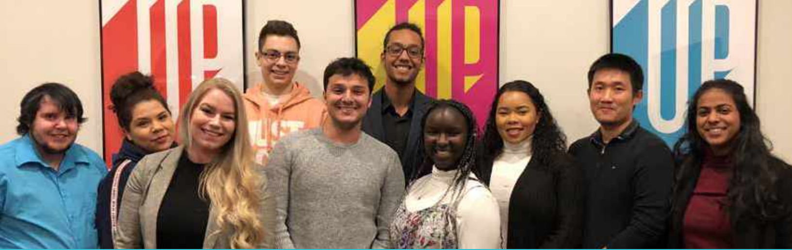
YOUNG PEOPLE'S ADVISORY COUNCIL 2019-2020

“I believe there are four words more powerful than ‘I love you,’ and those are ‘I’m here for you.’ I’m not just a client or a number; I’m a human and I need to be cared about.”